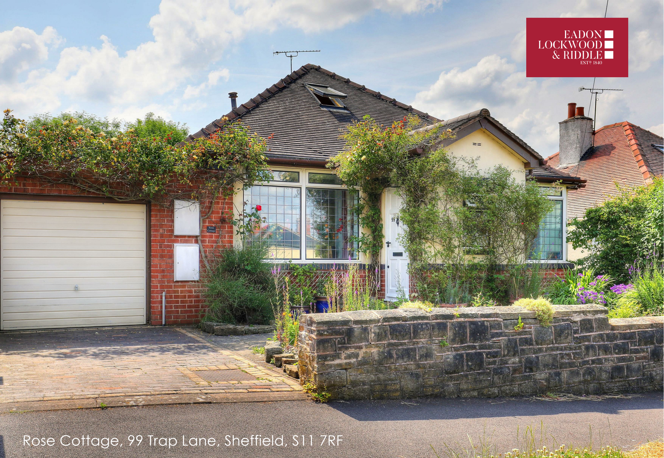
Rose Cottage, 99 Trap Lane, Sheffield, S11 7RF